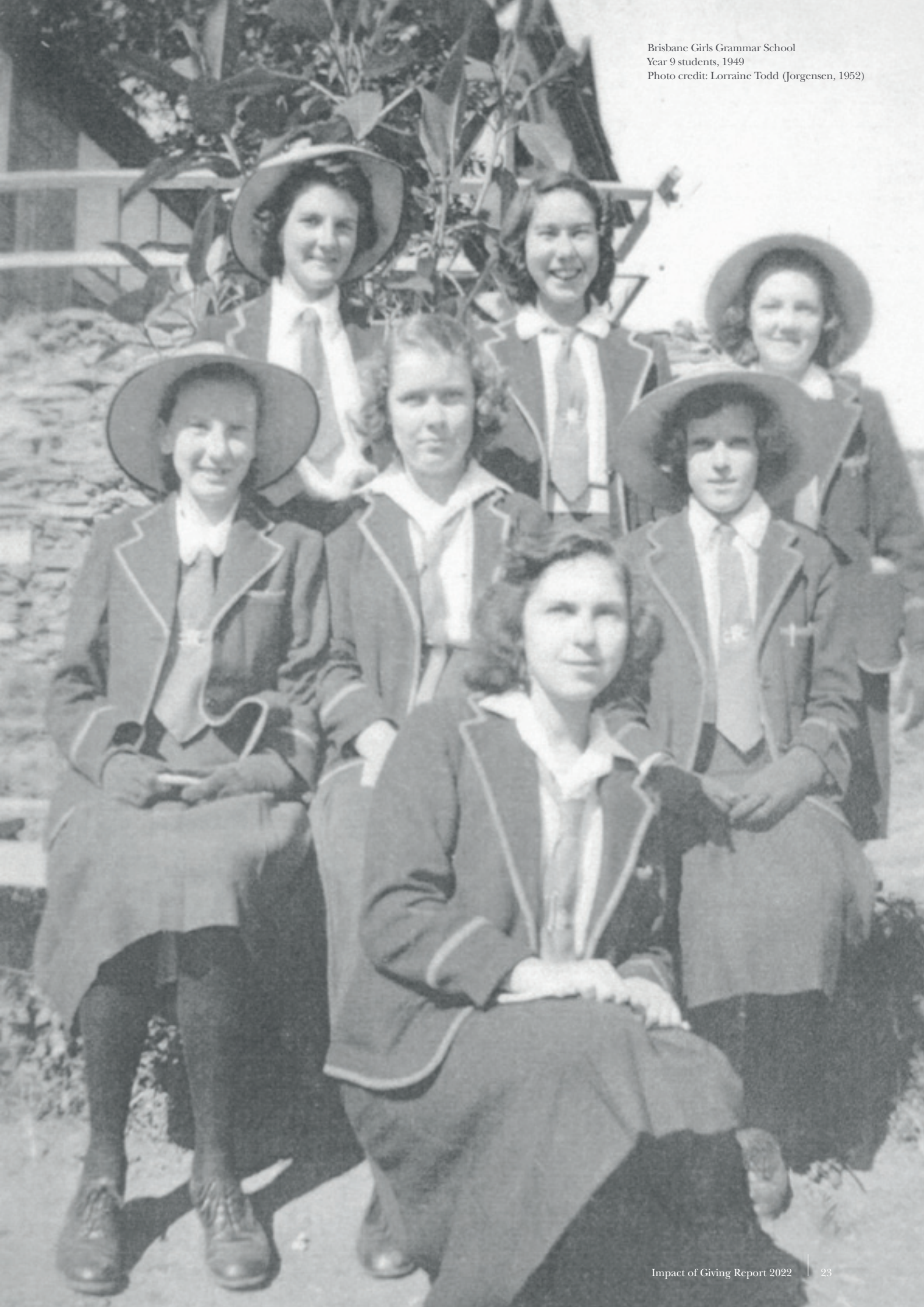
Brisbane Girls Grammar School Year 9 students, 1949